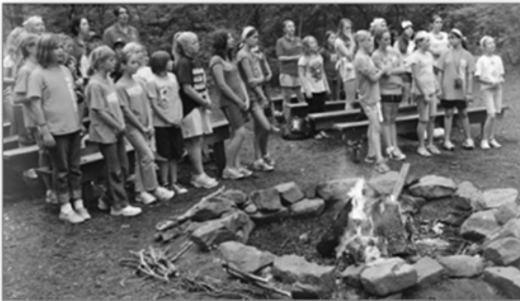
Above: Girl Scouts around the campfire Left: An Eastern Saw-whet owl, one of the beneficiaries of this project. Below left: Girl Scouts exploring a stream on the Camp