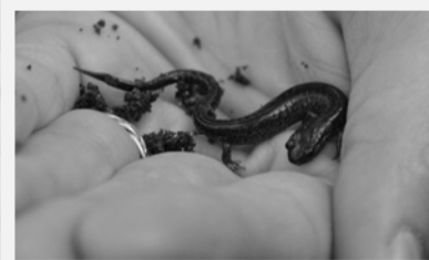
Lead back salamander

Now we launch into the "due diligence" phase, where we sign the grant contract, get a second appraisal (required by DCNR), get a survey, prepare legal documents, do an environmental study, and do a baseline documentation of the property. We also will be continuing to fund-raise. The DCNR grant is a matching grant, and although we now have enough to squeak by, we are still hoping to be able to cover some more of the stewardship, transaction, and easement purchase costs before finalization. This will help both the Girl Scouts in the Heart of Pennsylvania, who own the property, and Manada Conservancy.