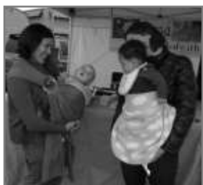
The plant sale is a great place to make new friends!