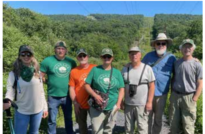
Board visit to property

Stretching over the top of Second Mountain of the Kittatinny Ridge Conservation Landscape, the view extends as far as the eye can see with the Susquehanna River and beyond to the south and Peters Mountain to the north. The property's mountain springs feed Fishing Creek which empties directly into the nearby Susquehanna River, the predominant freshwater source for the Chesapeake Bay.