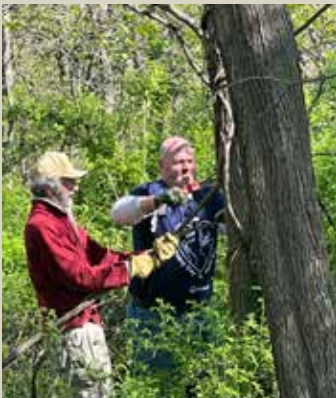
Veolia's 2024 workday launched the first restoration efforts