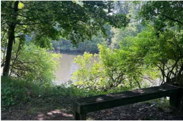
Nearly 2 acres of invasives cleared

Here's a look at what's been accomplished so far!