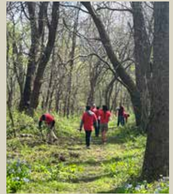
Veolia's 2025 workday