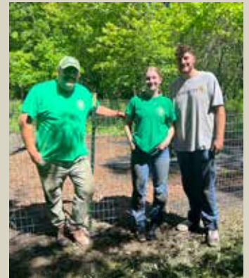
2025 Sunset Grove with plants from our own nursery