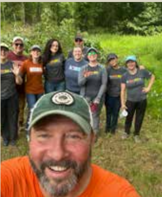
Hershey Company Tech Team 2025 workday