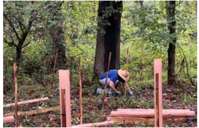
125 Native trees and shrubs were planted in areas where Multiflora Rose was removed