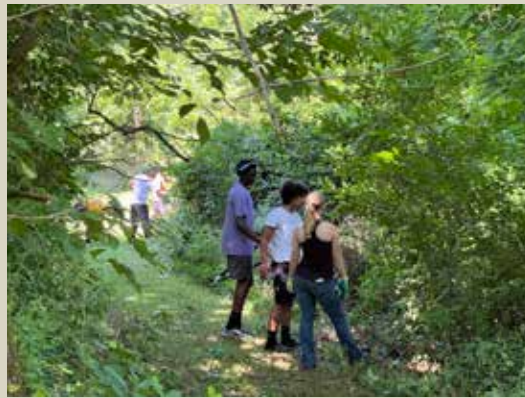
Milton Hershey School cleared invasives and uncovered Founders Grove in 2024, returning in 2025 to continue the work