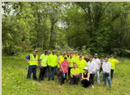
2025 Schneider Electric workday